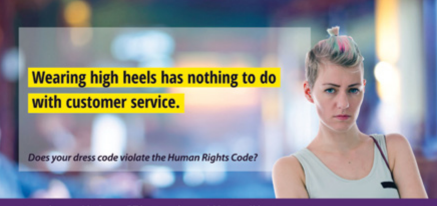
Learn about your rights & responsibilities at www.ohrc.on.ca | @OntHumanRights